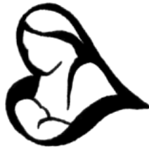
Conference logo by Sally Allison

NONPROFIT ORG U.S. POSTAGE PAID PENFIELD, NY PERMIT NUMBER 29